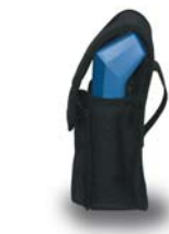
Protective Carry Pouch with belt loop (optional)