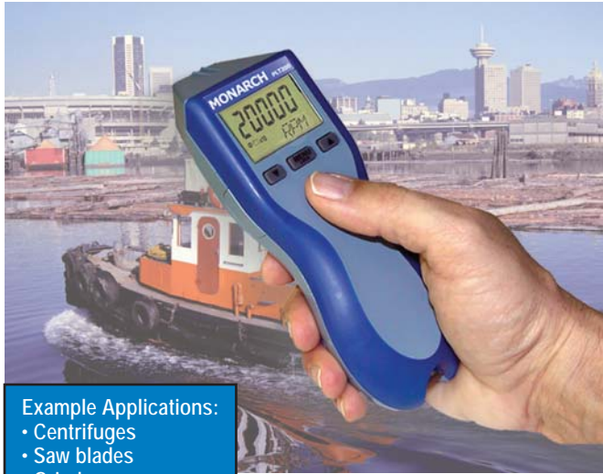
Pocket Laser Tach 200