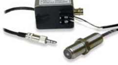
Remote Magnetic Sensor (MT-190-P) Gap 0.25 inches