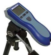
PLT200 and PT99 have a 1/4 20 threaded bushing for tripod mounting

The rugged and versatile Pocket Laser Tach is ideally suited for non-contact, contact and linear speed measurements.