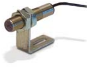
Remote Infrared Sensor (IRS-P) Gap 0.50 inches

Remote Contact Assembly (RCA) with 6 foot (1.82m) cable, Contact Tips and 10 cm Linear Contact Wheel (Shows optional 12 inch circumference Linear Contact Wheel)