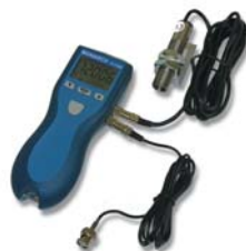
PLT200 shown with optical sensor and output cable