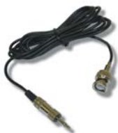
Pulse Input/Output Cable Input/output cable with BNC connector